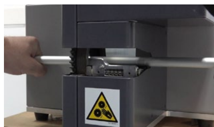
Easy to use, industrial standard