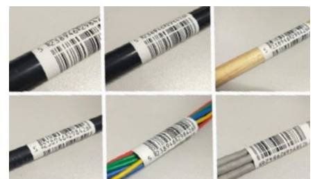
Wide range of applications